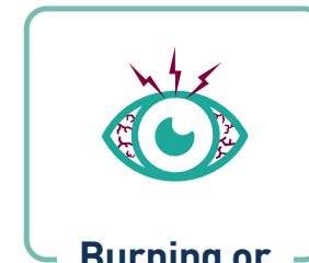
Burning or stinging eyes